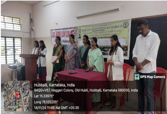
Hubballi, Karnataka, India 84QG+V57, Heggeri Colony, Old Hubli, Hubballi, Karnataka 580030, India Lat 15.33978° Long 75.125235° 14/11/24 11:49 AM GMT +05:30