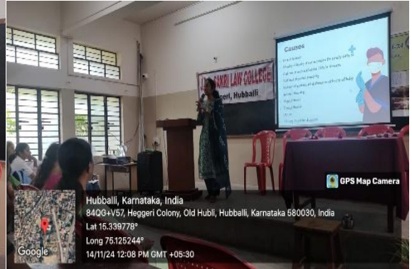
Hubballi, Karnataka, India 84QG+V57, Heggeri Colony, Old Hubli, Hubballi, Karnataka 580030, India Lat 15.339778° Long 75.125244° 14/11/24 12:08 PM GMT +05:30