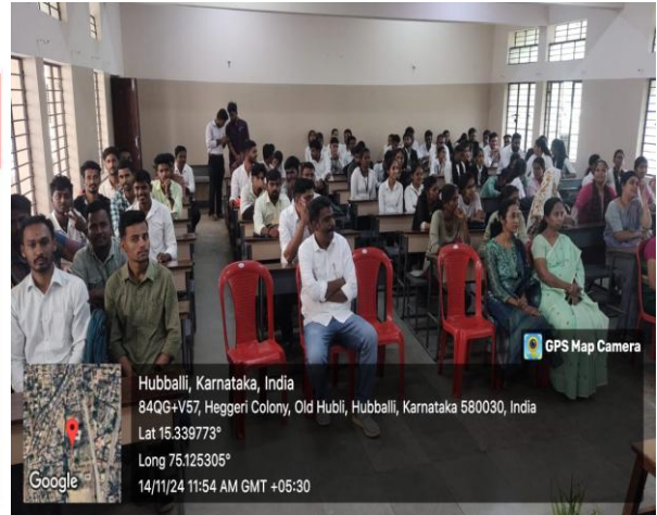
Hubballi, Karnataka, India 84QG+V57, Heggeri Colony, Old Hubli, Hubballi, Karnataka 580030, India Lat 15.339773° Long 75.125305° 14/11/24 11:54 AM GMT +05:30